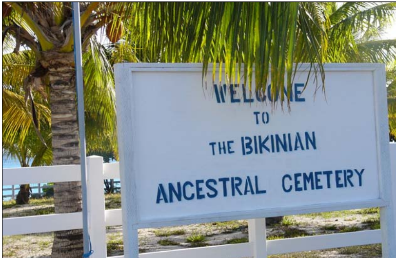
A sign welcoming visitors to Bikini, where the Bravo shot was detonated on March 1, 1954