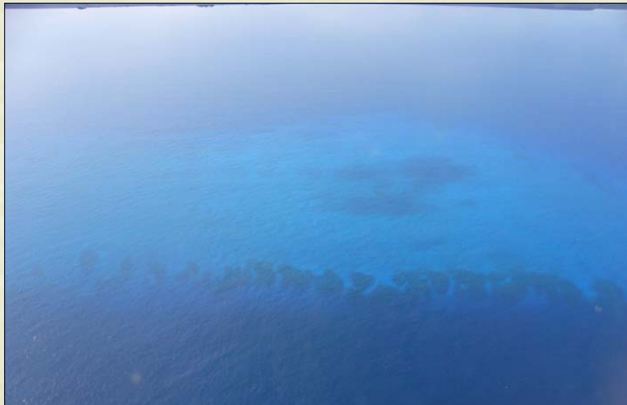
The famous “crater” in Bikini where the Bravo shot was detonated on March 1, 1954.....June 16, 2005